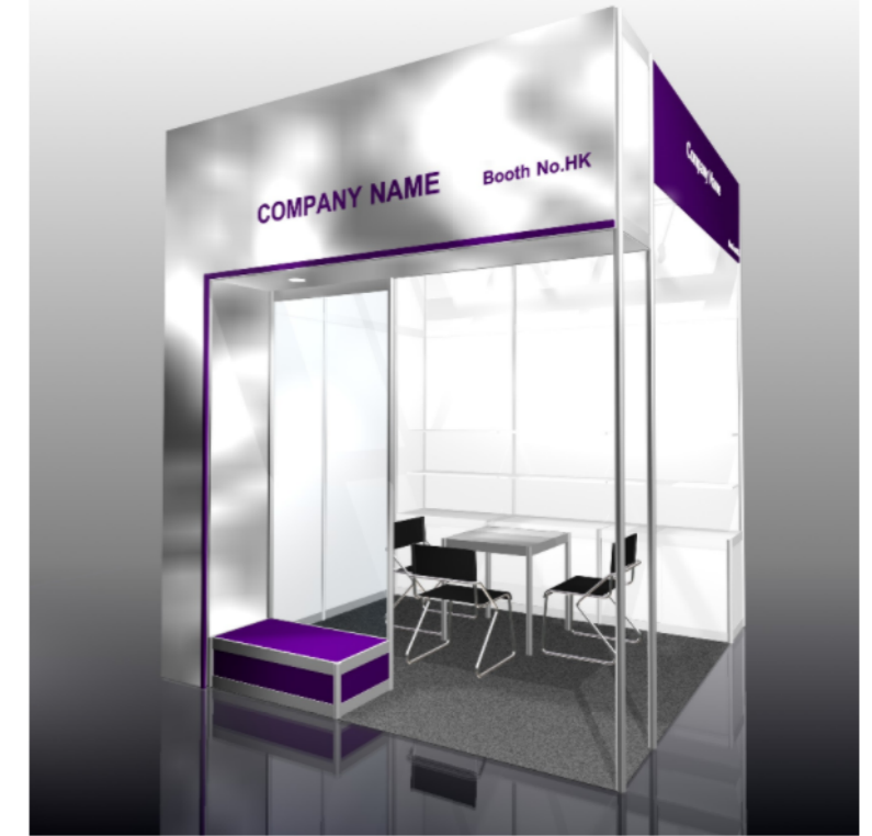
COLOUR PERSPECTIVE N.T.S.